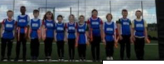
KS1, Year 3/4 and Year 5/6 Tag Rugby Teams.

3 Football Teams! Boys A team Boys B team Girls A team